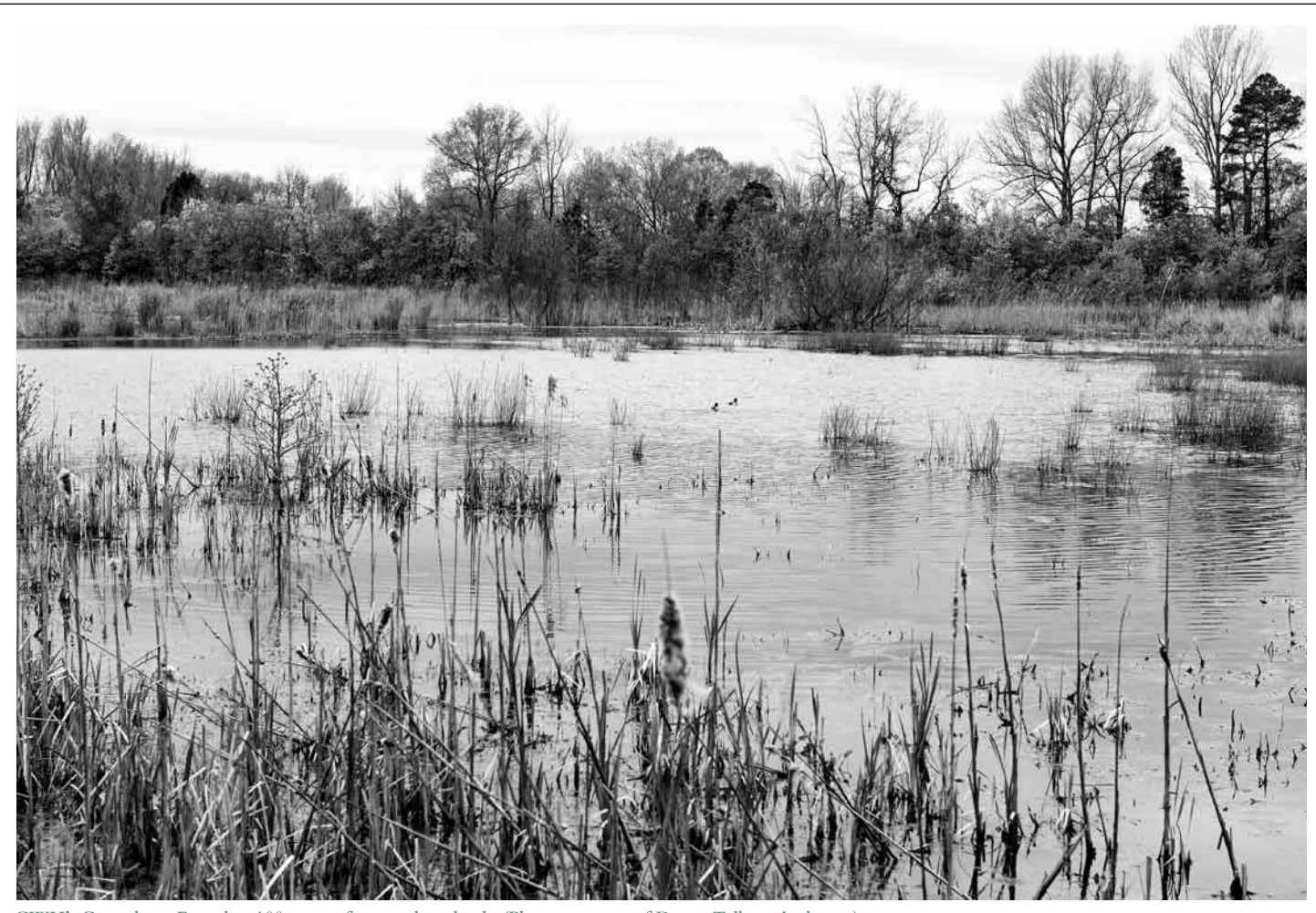
CWH's Canterbury Farm has 100 acres of restored wetlands.

suspected that there was a woodcock there under a shrub as they had been dancing in this field since the end of January. Sure enough as I walked in on the point up fluttered the "mudbat". However, the dog stayed on point and then slowly crept in to the flush site sniffing the ground heavily. To my delight there was a woodcock nest with 4 brownish eggs! The eastern population of woodcock and other early successional wildlife has been declining as this habitat type has faded from our landscape. CP-23 is a cost-effective way to restore and maintain early successional habitat.