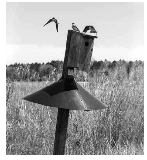
Tree Swallows using a CWH nesting box.