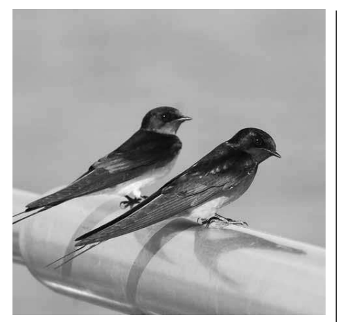
Barn swallows.