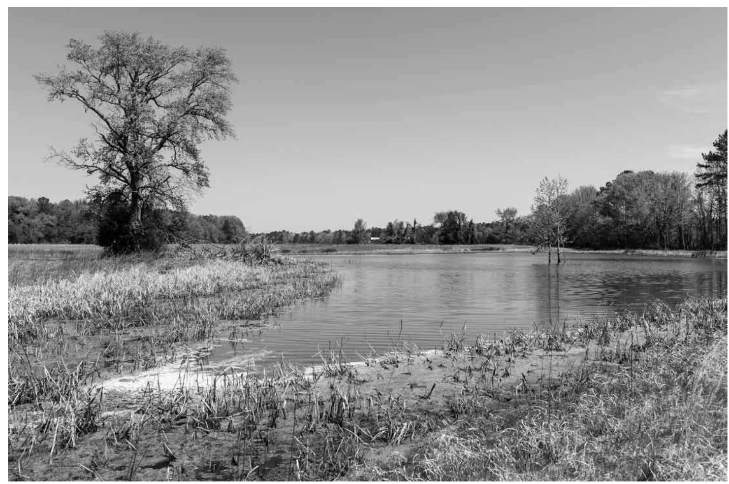
A CWH restored wetland at Talisman Farm near Grasonville, Maryland.