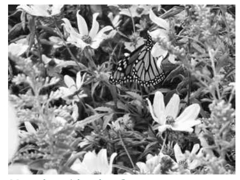
Monarch on tickseed sunflower.

Almost ALL of the wetlands and buffers you see being installed are being paid for by the USDA with some assistance at times from the MD Department of Agriculture and the MD Department of Natural Resources. In an age when everything is "on the table" in terms of potential budget cuts, we need to realize that the great majority of conservation work in Maryland (and the country) is paid for by the government. Most of the work done on farmland is covered by the USDA through the Conservation Reserve Program, the Conservation Reserve Enhancement Program or the Wetlands Reserve Program.