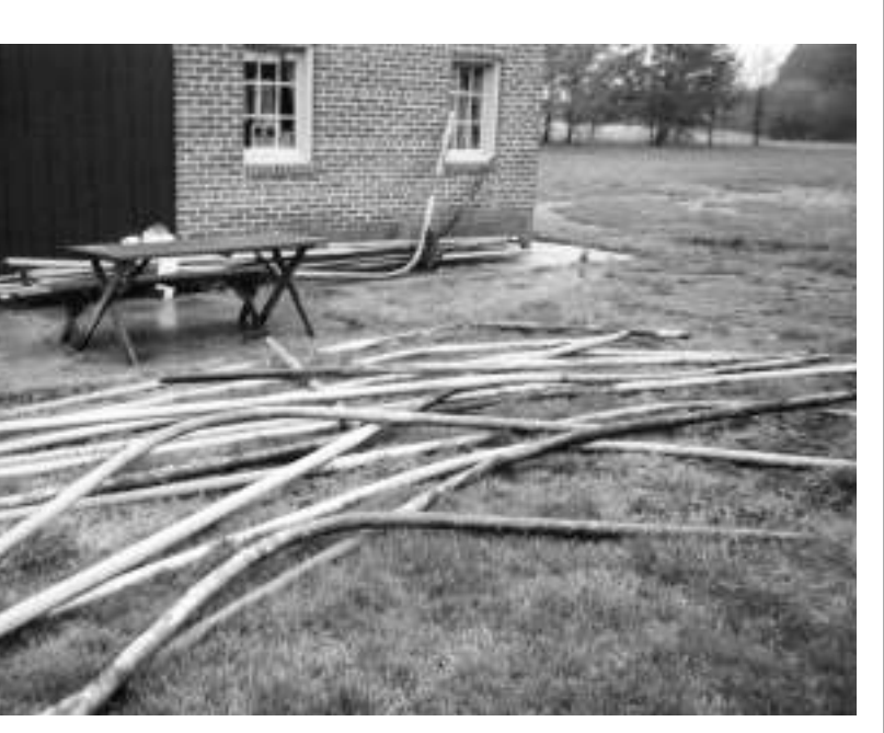
BENDING STEEL? Many of you may know first-hand that the winter of 2002/03 was harsh for Osprey in the area. The nesting platforms they returned to in March had fallen over. CWH received a record number of calls this past spring about Osprey platforms in need of being uprighted. This photo shows what the ice did to the poles. Our staff worked feverishly after the spring thaw to get as many Osprey platforms back in place as soon as possible.