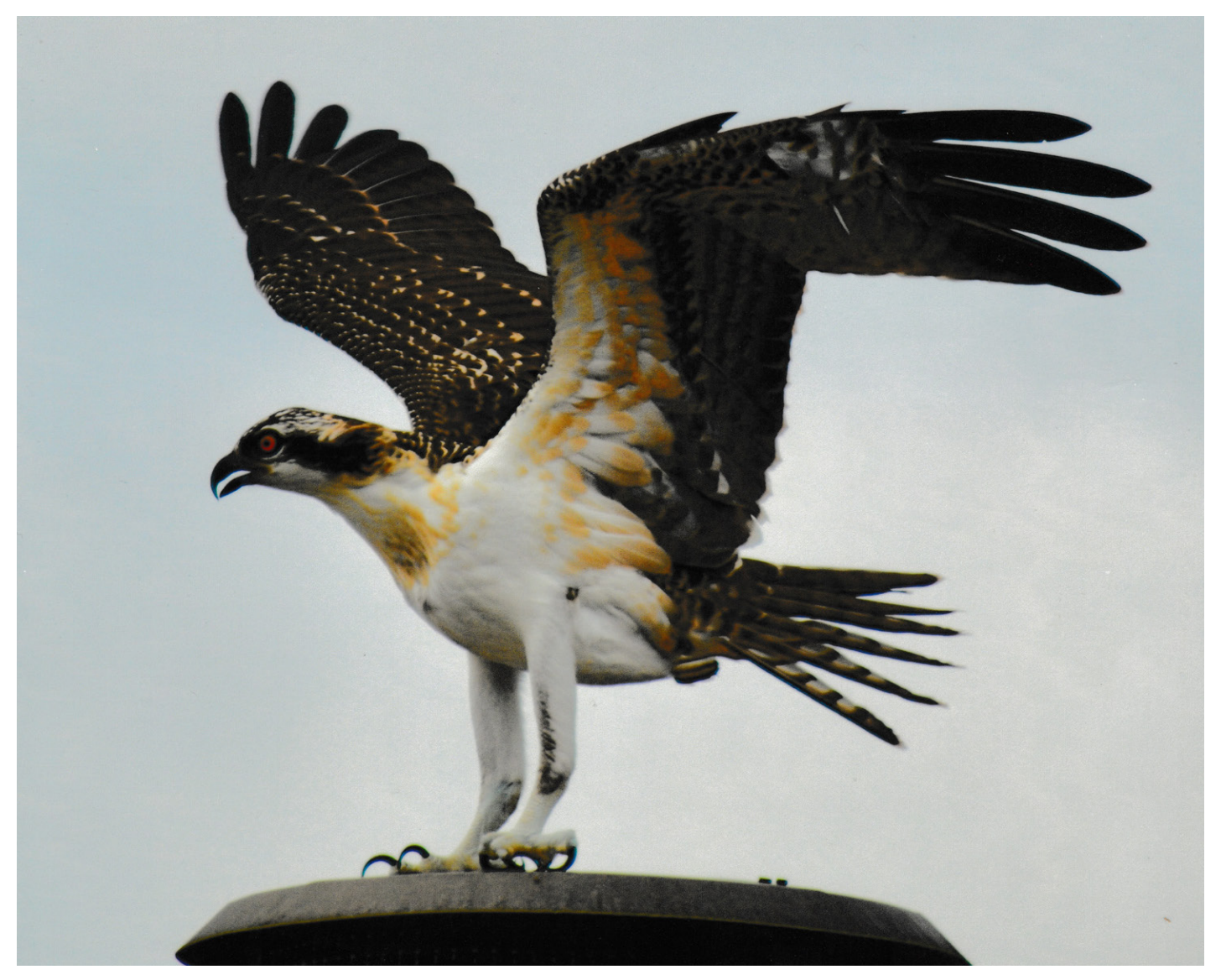
This photo was taken on July 16, 2020. It shows the first fledgling, a female (note the dark feathers on her breast), having landed on top of the chimney at 542 Moorings Circle.

Next spring, the platform will have a brand-new nest, probably built by the same pair who built this year's nest. The young birds are very busy, and it is relatively rare to see all three of them in the nest at one time.