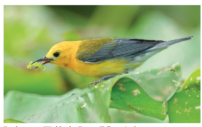
Prothonotary Warbler by Donna Tolbert-Anderson

In these varying roles, forest insects can help to control plant succession, dictate which plants will grow or thrive in particular areas, and invigorate plant communities.