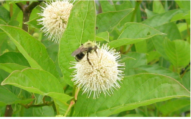
Bumblebee on Buttonbush