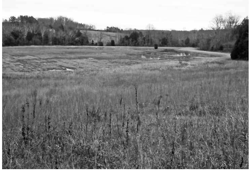
Restored wetland at Fulfillment Farms with pools of water beginning to form. Soil taken from the wetland area was used to create the berm.

Please send your email address to info@cheswildlife.org so we can let you know when the page is up!