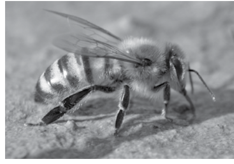
European Honeybee (Apis mellifera) Bees are more compact and hairier than wasps since they are principally pollinators—the hairs on their bodies and legs carry pollen from one plant to another.

Native bees have intriguingly long generic names, like Lasioglossum and Agapostemon ; the latter includes the brightly