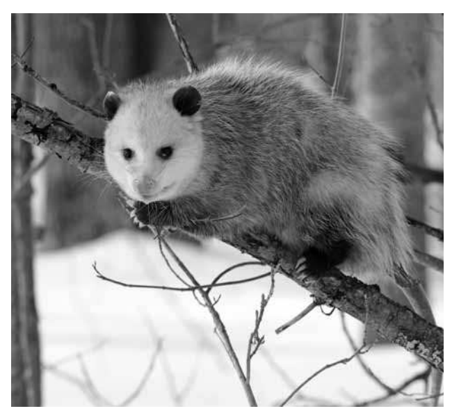
The Virginia Opossum ( Didelphis virginiana ) is one of the most unique critters found in our area.

Since opossums often feed on road kill, one of the most deadly threats to them is the automobile. In addition, dogs and greathorned owls can be serious predators of the opossum. In general, however, opossums are doing quite well in the modern world.