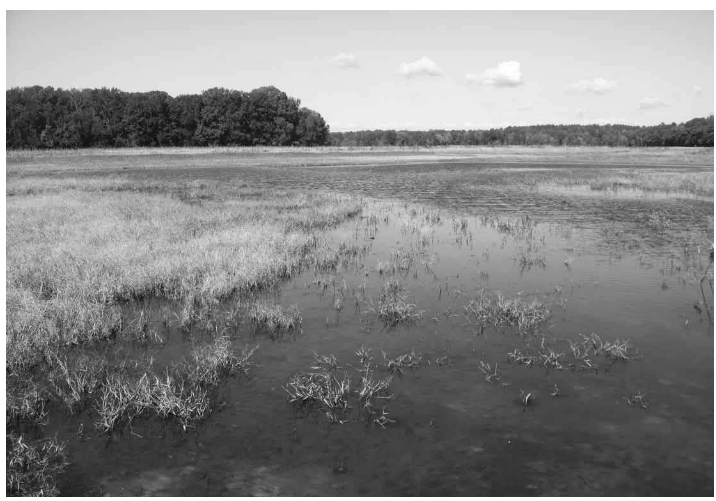
After: The same field on Talisman Farm, now with a wetland restored by CWH—turning part of the problem into a solution.