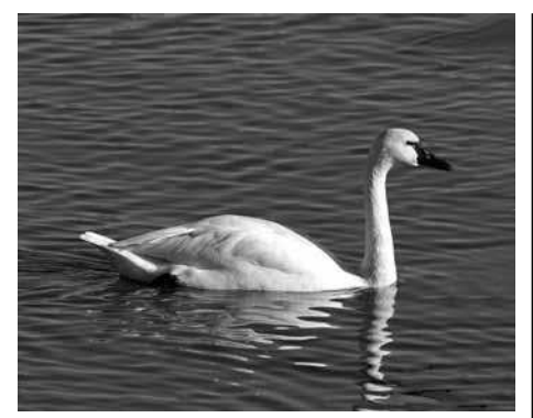
Hoghole Creek on Talisman Farm is a nice sanctuary for waterfowl such as the Tundra Swan ( Cygnus columbianus ).