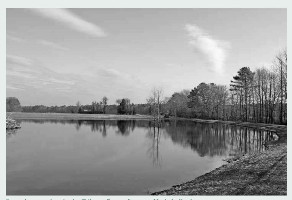
Recently restored wetland at Talisman Farm, adjacent to Hoghole Creek.

A new permit requirement (Notice of Intent) permits from the MD Department of the Environment) is making it even more difficult to get wetland restoration (and other conservation practices that require earth moving) on the ground. MDE says that they have to require the permits due to a mandate from the EPA, as a result of the Clean Water Act. The new law requires that a local sediment and erosion control permit be obtained from the county where the work is being done whenever more than one acre of land is disturbed. This must then be submitted to MDE along with a fee for its approval. The worst part is that MDE puts these sediment control plans for wetland projects on public notice for 45 days in case someone wants to comment (so far no one has). The bottom line is that CWH is disturbing small areas in order to improve the quality of farm runoff and create wildlife habitat. A farmer can (and often does) create bare ground on hundreds of acres with a large disc and NO buffers or plans are