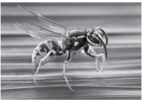
European Wasp (Vespula germanica) are slender with relatively shiny bodies, their legs round, and the connection between the thorax and abdomen is usually narrow.

So—bee or wasp? Those were wasps, but what is the difference? More recently, on more than a few occasions, when a Hymenopteran (the taxonomic order containing both bees and wasps) has been described to me, I will ask first, "Was it a bee or a wasp?" The answer has been "What is the difference?" Vespid wasps, the ones from just one family that we typically consider as wasps or yellow jackets, are primarily predators (parasitoid type), and hence more aggressive than bees, with many being good