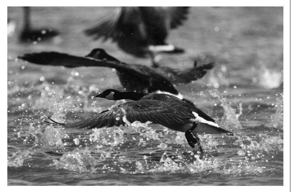
Canada Geese enjoy a restored wetland at Bennett Point Farm near Queenstown, which is co-owned by Chesapeake Wildlife Heritage and the Eastern Shore Land Conservancy.

he Waterfowl Festival Canada Goose Sanctuary Program provides valuable winter habitat for native migratory Canada Geese. The program is funded by the Waterfowl Festival and administered by Chesapeake Wildlife Heritage.