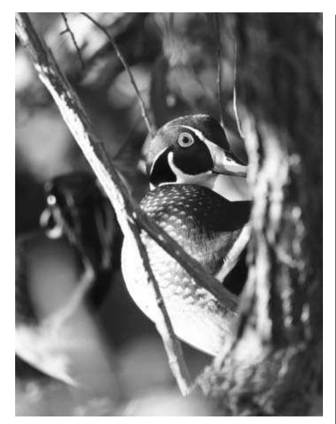
Wood Duck at Canterbury Farm