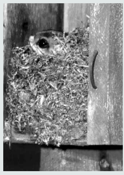
Due to the nocturnal behavior of Flying Squirrels, many people are unaware of how common they are on the Eastern Shore. Flying Squirrels will use manmade nesting structures, such as this bluebird box which contains an abandoned Chickadee nest.

The population density depends on the quality of habitat. In favorable habitat, densities can approach five squirrels per acre. Estimates of home range size, the area used for normal day-to-day activities, range from about one acre to five acres. Females defend their home range, at least during parts of the year, and there is little or no overlap with the