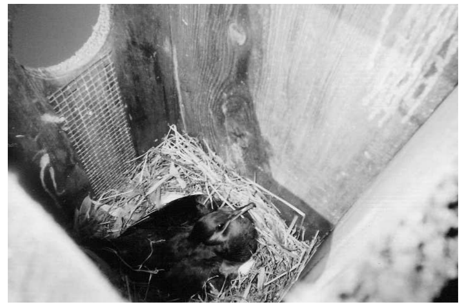
A Hooded Merganser hen finds a safe place to lay her eggs in a CWH Wood Duck box in Worton, MD.

During the breeding season they normally lay 8-12 eggs in a natural tree cavity or in a fallen hollow log. Most adult birds return to breeding grounds as mated pairs but the males promptly disappear from the nest areas when their mates start to incubate. As adults, Hooded Mergansers return to the same area to nest as they