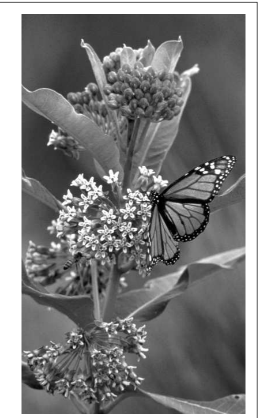
A Monarch Butterfly nectars on a Milkweed flower

are lethal even to monarch caterpillars.