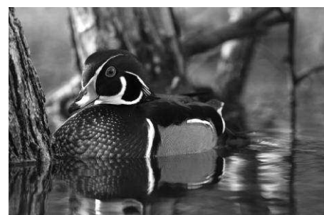
Nearby a CWH Wood Duck box, photographer David Judd of Delmarva Photo captured the amazing beauty of the Wood Duck.

We would like to thank the Snyder Foundation for Animals, Fair Play Foundation, Waterfowl Festival, Nathan Foundation, and an anonymous donor for over $32,500 in grant funds for our 2005/06 Wood Duck Box Program. The Wood Duck Box program has installed over 8,400 boxes since 1989 to provide suitable nesting habitat for these beautiful cavity nesting ducks. Each year an estimated 25,000 Wood Ducks fledge from these boxes. The great success of this program is a result of the very strong support of these foundations and our members. Thank you so much for your enduring support!