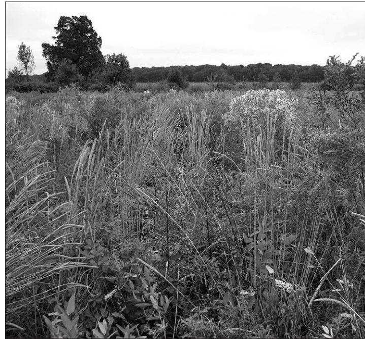
Does this support wildlife?

we can make people WANT the unprocessed, natural look of warm season grasses on their field edges to encourage songbirds and the almost forgotten quail. How can we make people WANT to convert a field of controlled, straight and neat rows of corn into a much more productive and profitable wetland with a diversity of plants of varying heights and textures, buzzing insects and a daily glance into the natural beauty of the UNcontrolled.