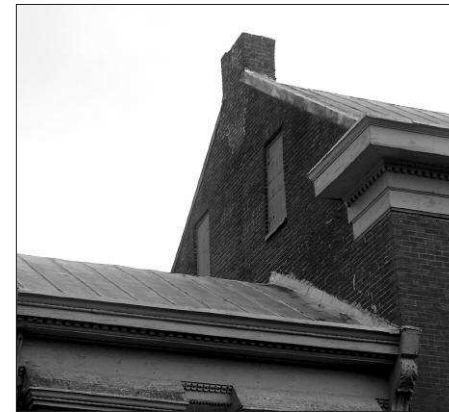
The acrobatic flight of Chimney Swifts is frequently seen in the skies over the town of Easton, where they can find shelter in chimneys such as these.

Swifts from using them as roost sites or nesting sites. Also, insecticides that are heavily used by many landowners have a grave effect on Chimney Swifts as the flying insects they consume and feed their young are often times tainted by sprays used near nesting and feeding areas.