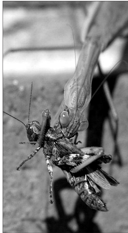
Praying Mantis finds a meal.