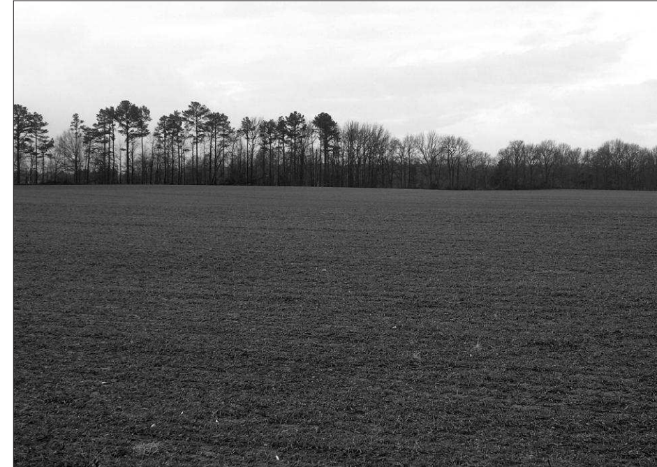
Or does this?

"Taking an eco-effective approach to design might result in an innovation so extreme that it resembles nothing we know, or it might merely show us how to optimize a system already in place. It's not the solution itself that is necessarily radical but the shift in perspective with which we begin,